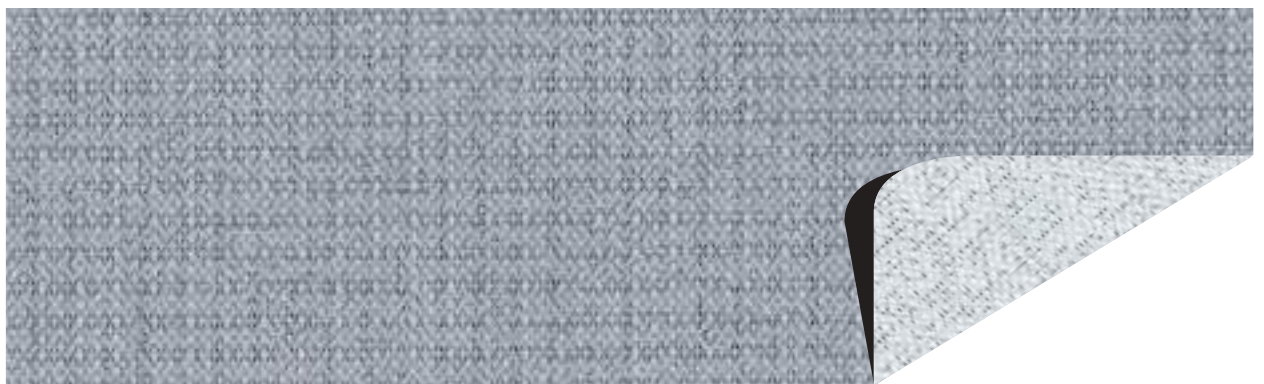
Dark grey/Alu 262 cm