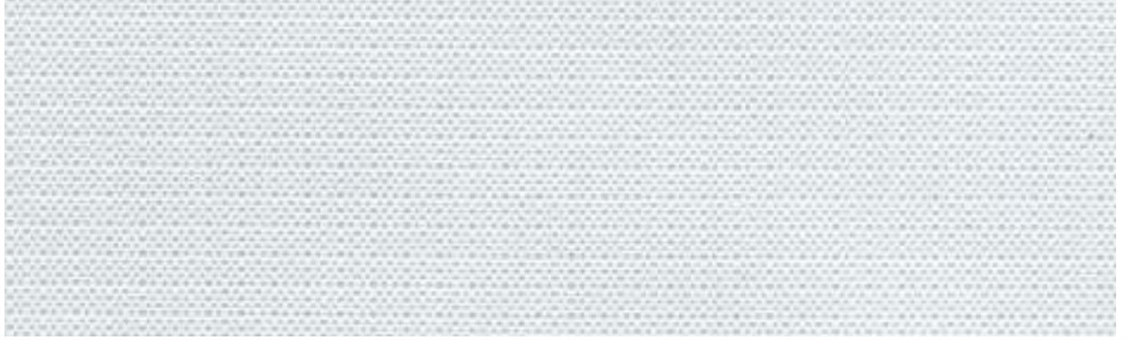
Translucent 262 cm