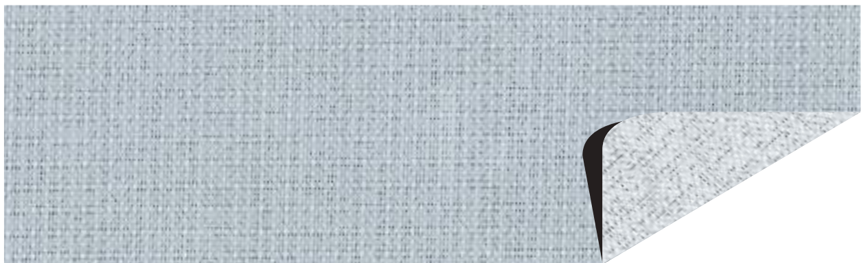
Translucent/Alu 262 cm