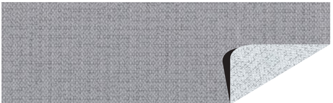
Beige/Alu 262 cm